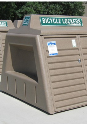
Bike lockers provide a bike with extra security and protection from the elements.

For maps, schedules, and other routes serving Mount Royal, see www.mtroyal.ca/AboutMountRoyal/TransportationParking/transit.htm