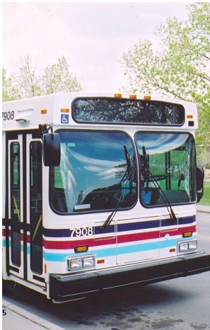
Pick up your U-Pass at the Parking Office, EA1016.