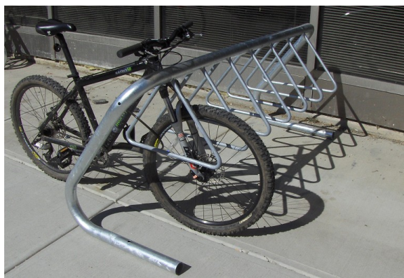
All of Mount Royal's "wheel-bender" style bike racks have been replaced with a more user-friendly model.

Check out what C-Choices has to offer for the upcoming year on Page 2.